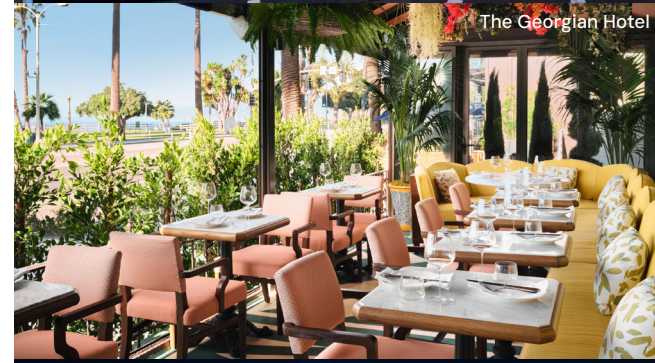
The Georgian Hotel