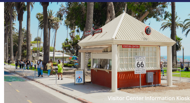
Visitor Center Information Kiosk

Wrap up your day with a classic coastal dinner at The Lobster , where fresh seafood meets stunning sunset views over the Pacific. As night falls, head back to the Santa Monica Pier, where the neon glow of Pacific Park's historic rides and games brings Route 66 nostalgia to life. Ride the world's only solar-powered Ferris wheel, take a spin on the Route 66-themed West Coaster and soak up the lively boardwalk atmosphere. Cap off your day with a nightcap at the legendary historic landmark Chez Jay , a dive bar steeped in Route 66 history—where Hollywood icons have long gathered over drinks and stories. Stop by on Wednesday night to catch live music and soak in the timeless atmosphere.