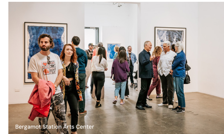
Bergamot Station Arts Center